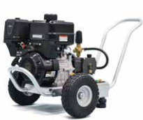
Direct Drive Cart and Skid