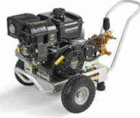
Belt Drive Cart and Skid